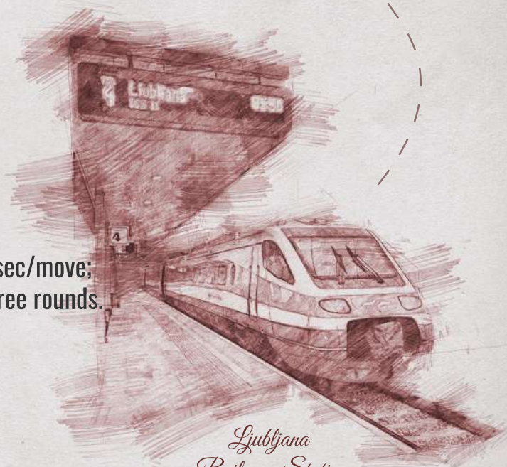
Ljubljana Railway Station